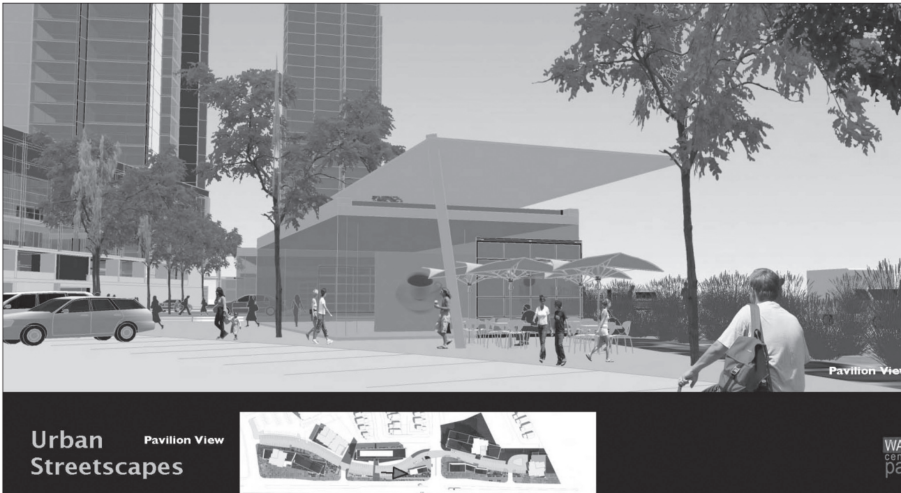
This artists' concept, which was presented to the Central Park community in December, shows the type of public space that would be included in the proposed development on Merivale Road.