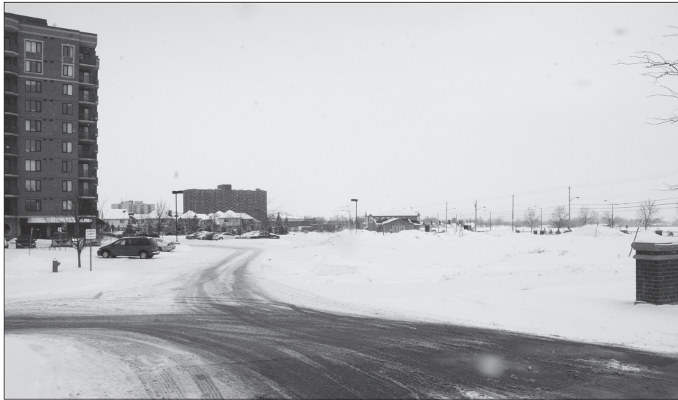
The site as it appears now: With the exception of a Tim Horton's and a sales centre, little else is happening on the property fronting on Merivale Road.

He added, "I think the city has tipped into urban living - it's a phenomenon that you can't predict, but you can observe. Buyer's aren't buying condos because the city says it should intensify, they're buying them because they want to live there."